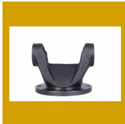
Cross Holder Gogo