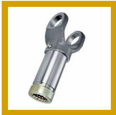
Full Yoke Propeller Shaft Component