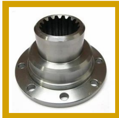
Drive Shaft Parts Companion Flange