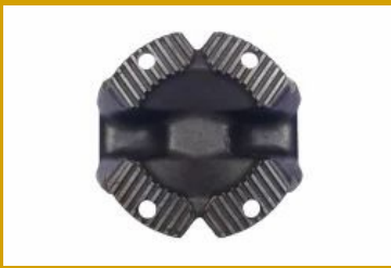
Cross Holder Serrated