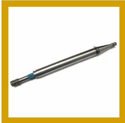
Steering Column Sleeve