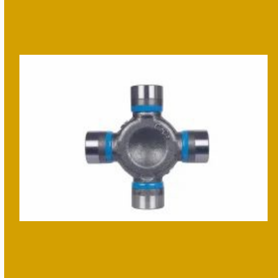
Universal Joint Cross Kit GX10MGN