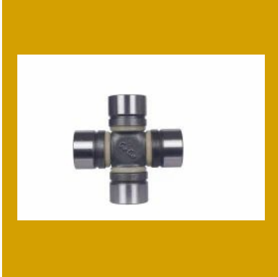
Universal Joint Cross Kit