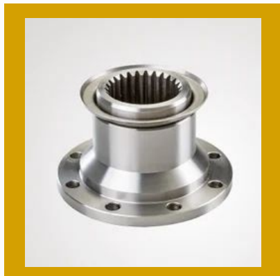
Companion Flanges 8 HOLES 26 TEETH