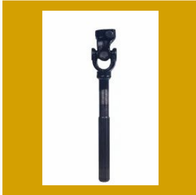
Steering Column Shaft Assembly LAYLAND DOST