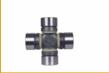
Universal Joint Cross Kit