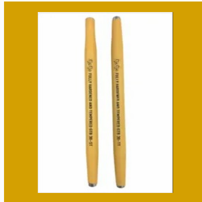
JACKROD GTB -60TT