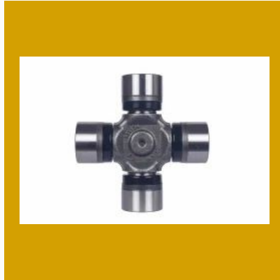
Universal Joint Cross Kit Grease Less