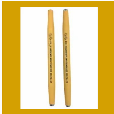
JACKROD GTB - 48TT