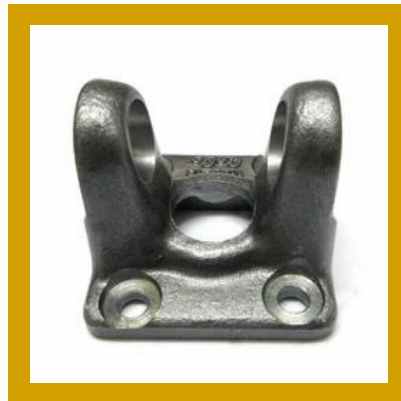
Ace Cross Holder