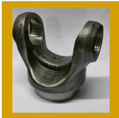
Half Yoke Propeller Shaft