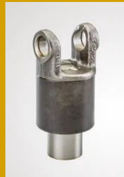
SLIP YOKE TATA ACE