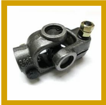
Steering Cross Assembly SCA03