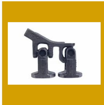
Housing Block Assembly HBA002