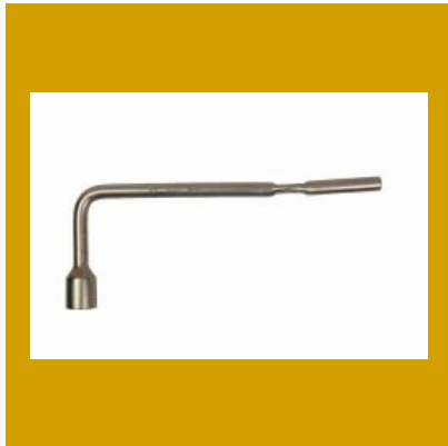
L Spanners For Wheels