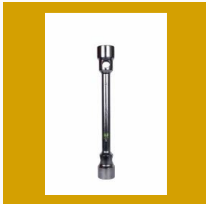
Wheel Spanner 32X32 CHROME