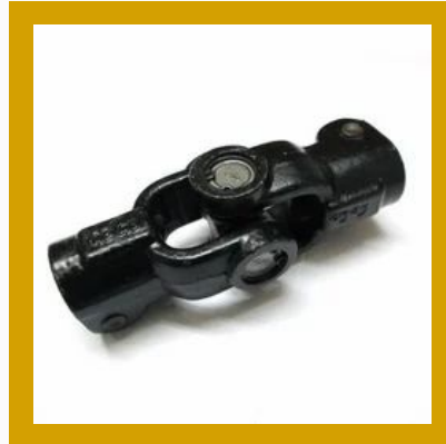
Universal Joint Cross Assembly SCA18