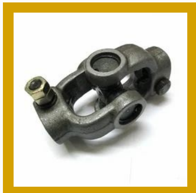
Steering U Joint Assembly