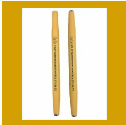
JACKROD GTB - 36TT