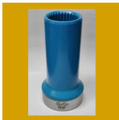
Rear Housing Bottle Glassy