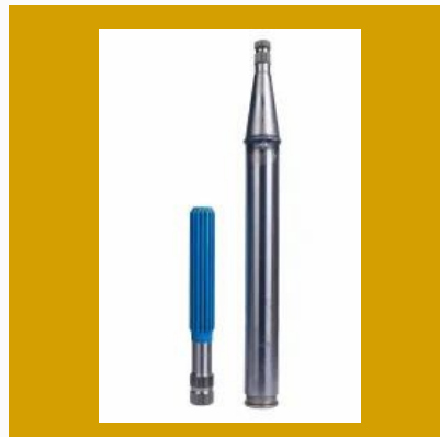
Steering Column Glide Coated