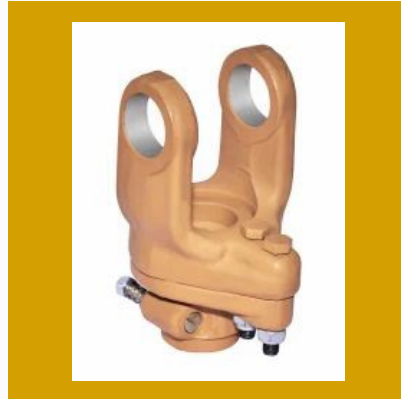
Rotavator PTO Shaft Yokes