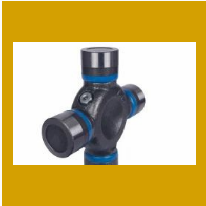
Joint Cross Kit Layland Tusker