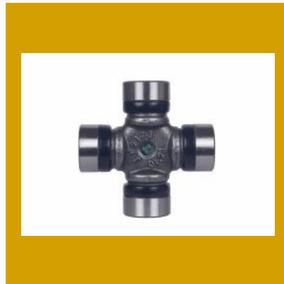
Joint Cross Kit GX18