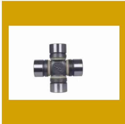
Universal Joint Star Pto GOGO