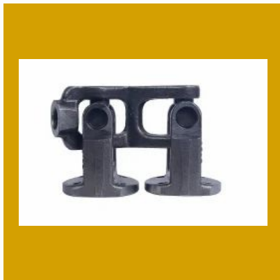
Housing Block Assembly HBA001