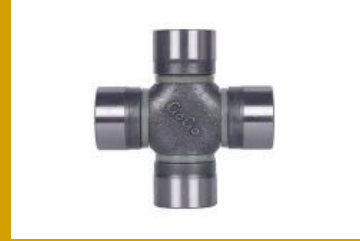
Universal Joint Cross Rotavator Small MINI Mahindra